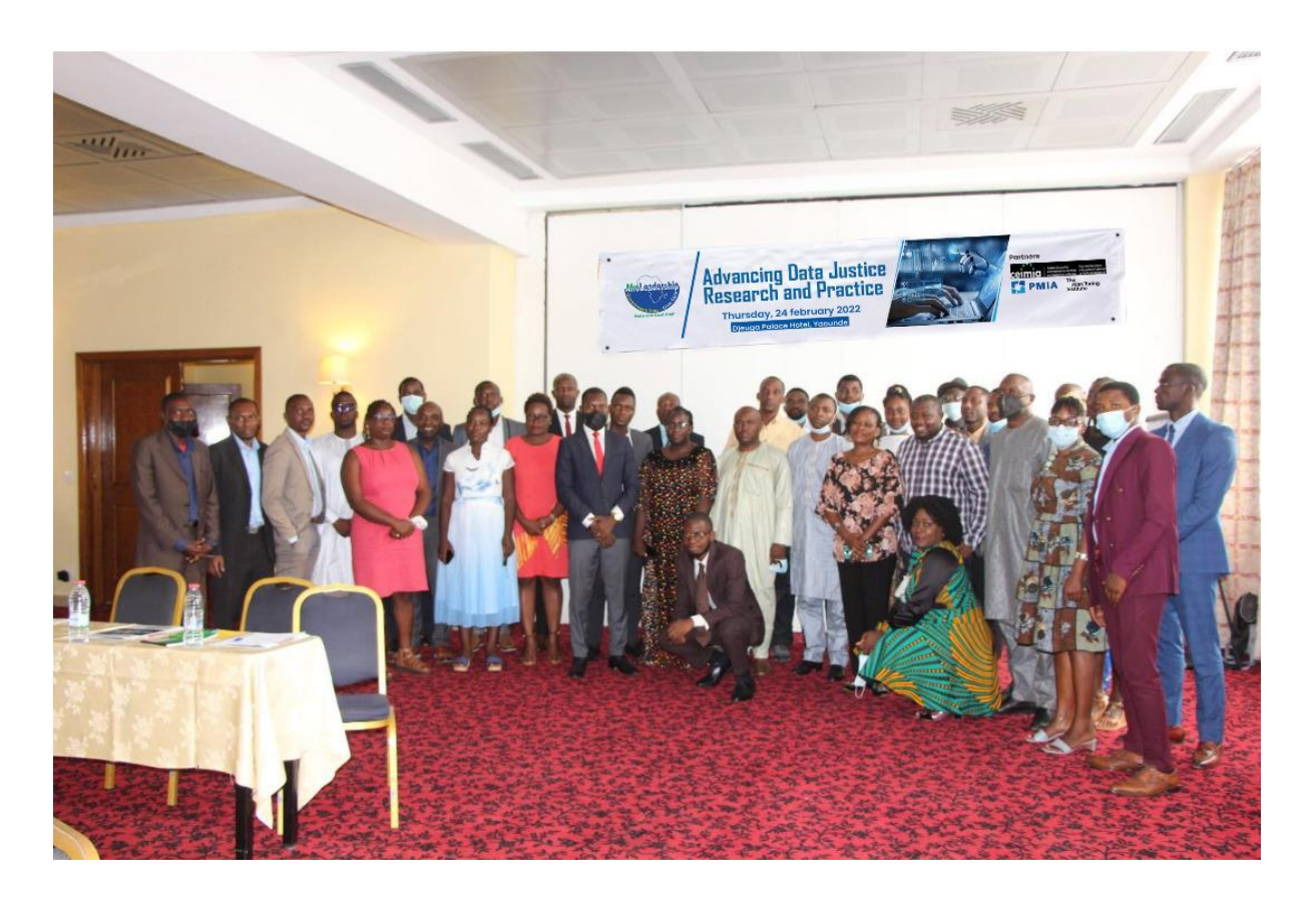
Family photo of the workshop